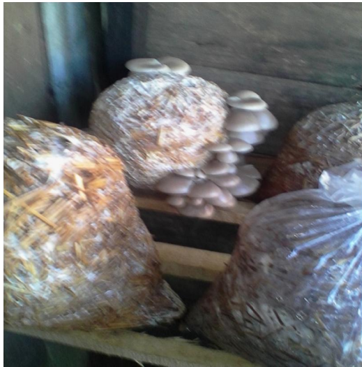
Mushroom cultivation at Sohpari