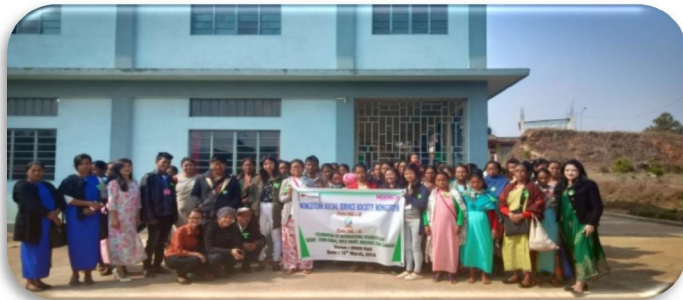
Celebration of International women's Day at NSSS