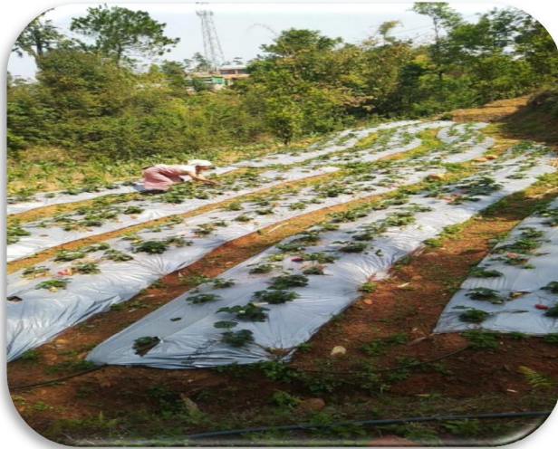
Strawberry cultivation at Umjaru