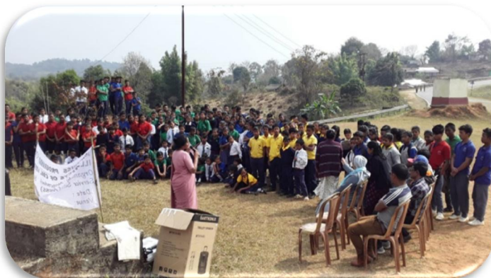
Awareness on the Ill effect of Coal mining at Umdang